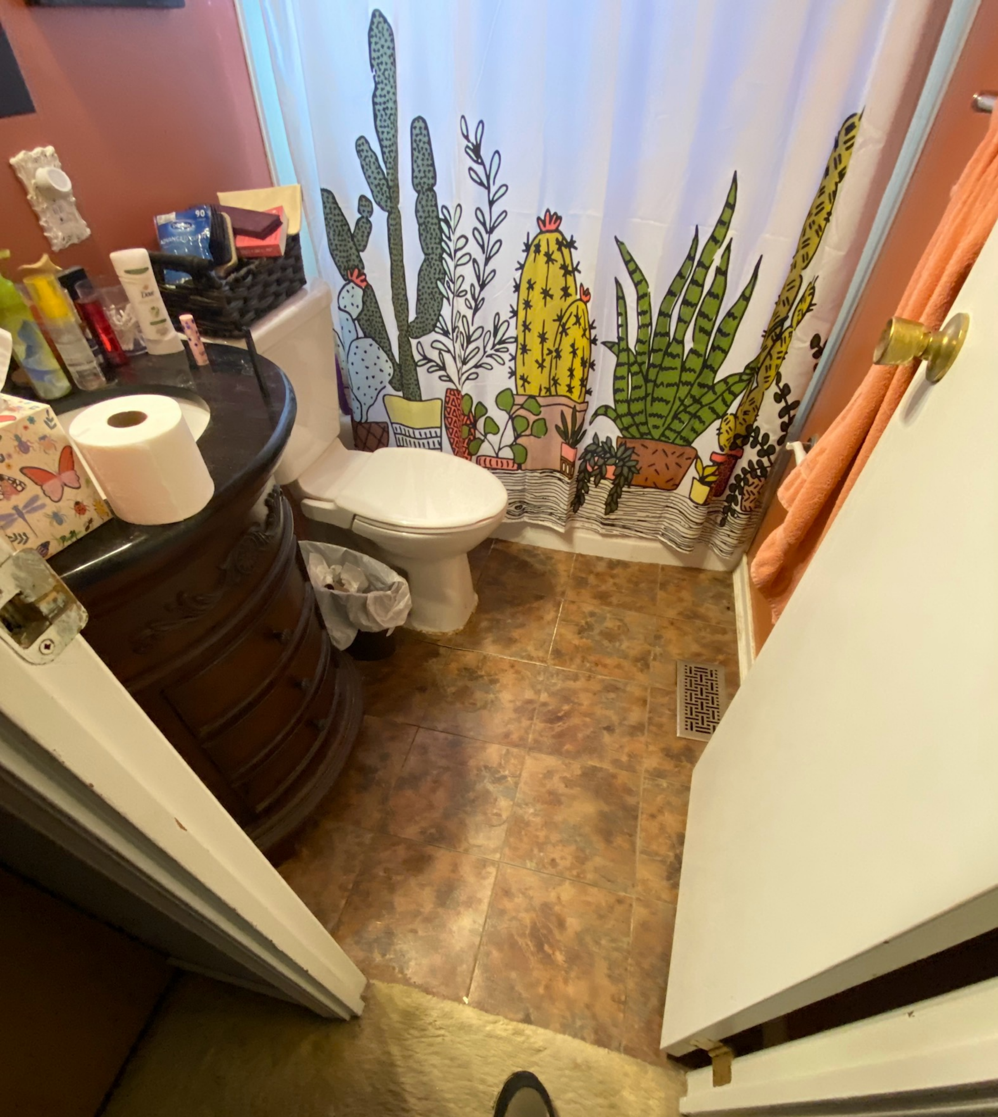
4123 Meadowridge. 10-28-24. Bath area