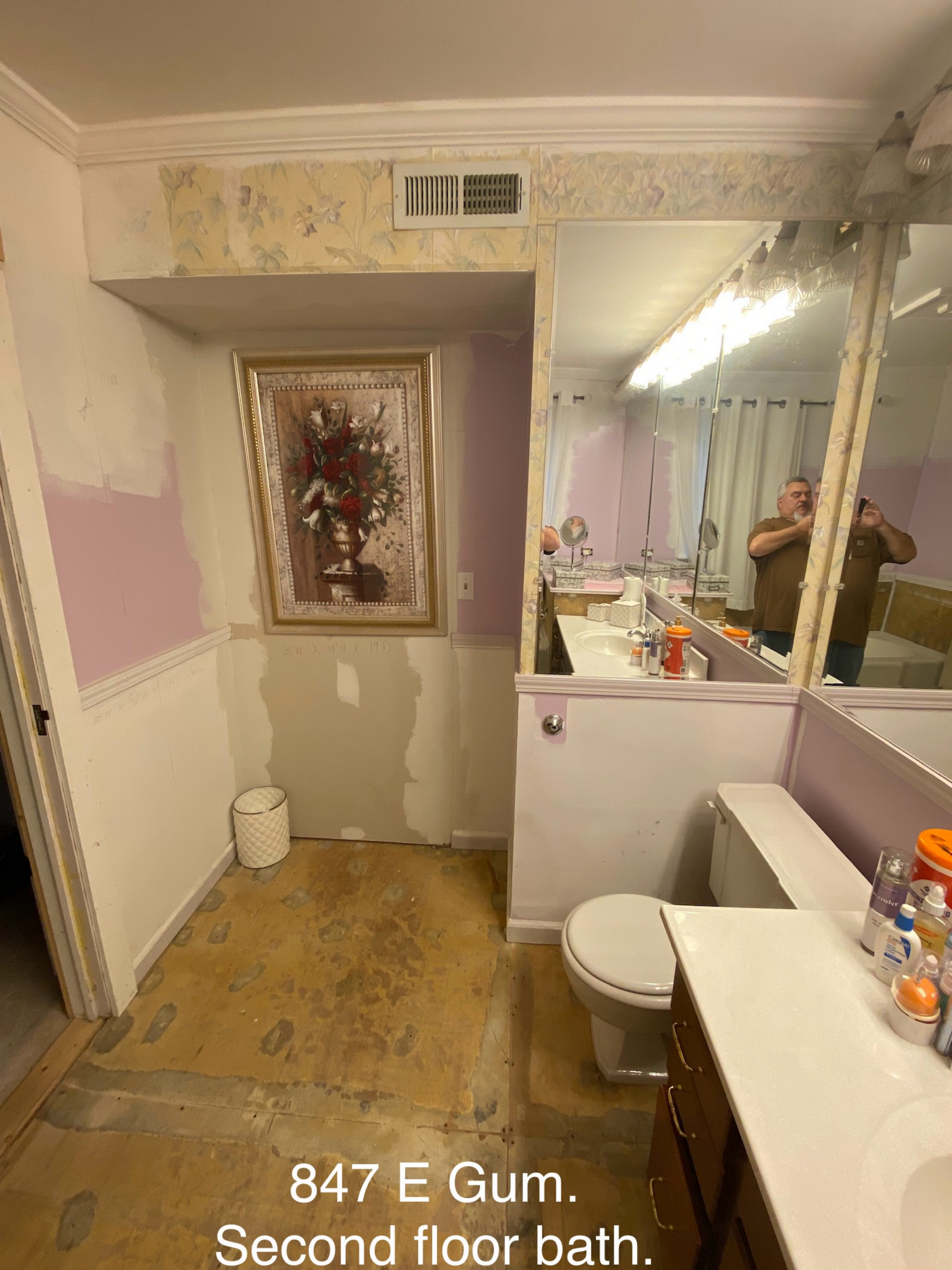
847 E Gum. Second floor bath.