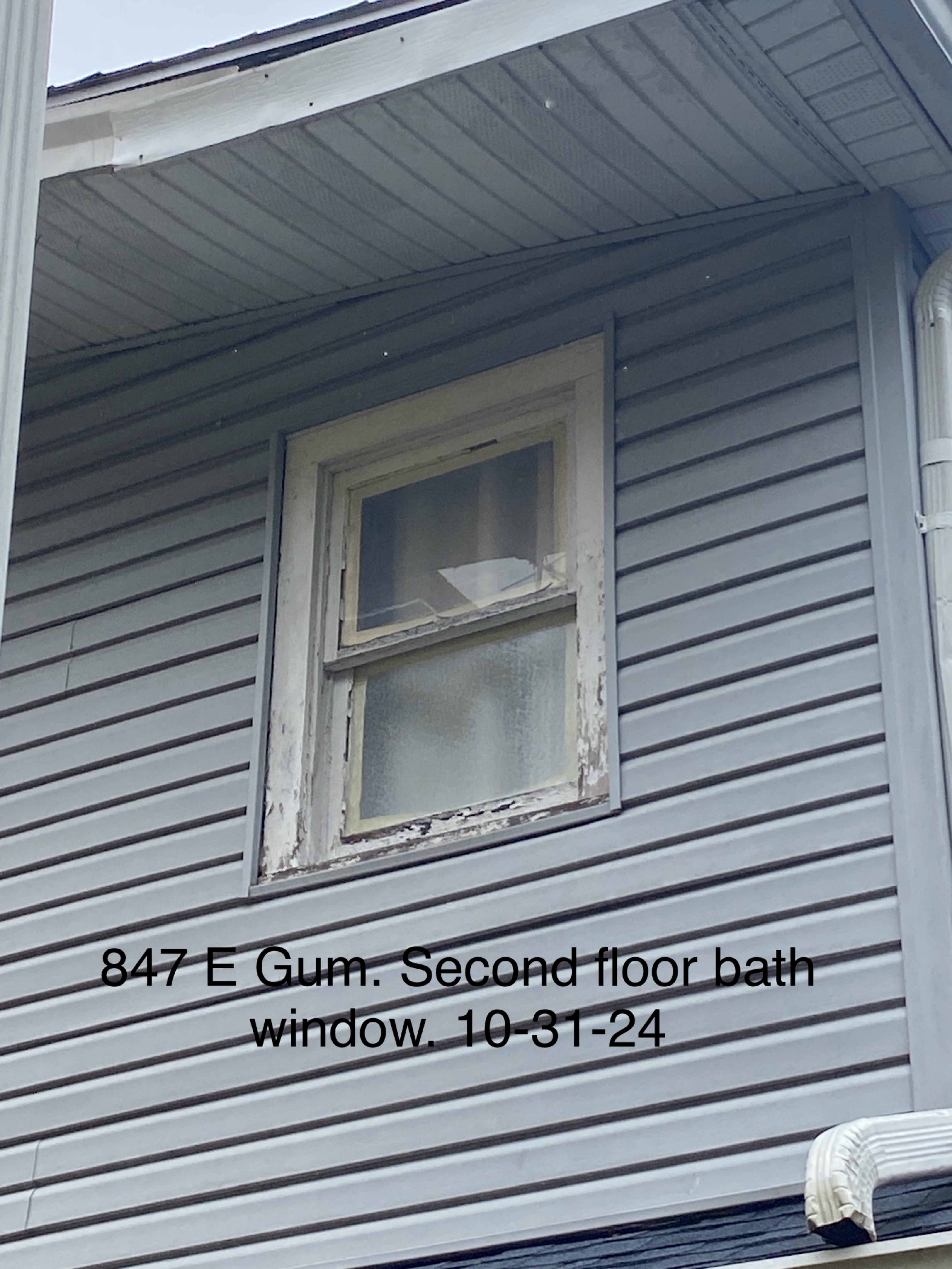
847 E Gum. Second floor bath window. 10-31-24